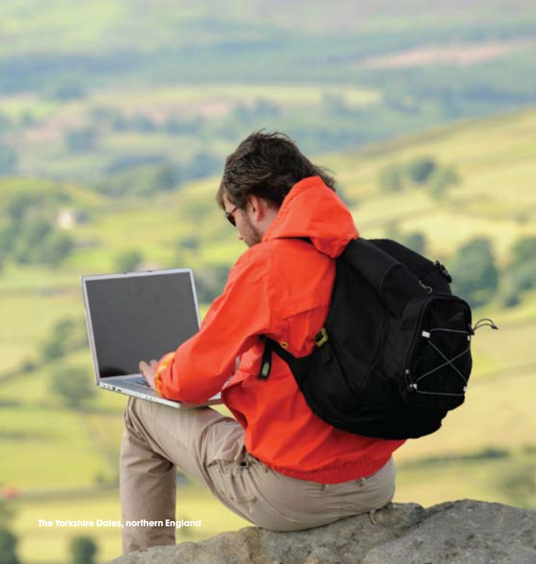
The Yorkshire Dales, northern England